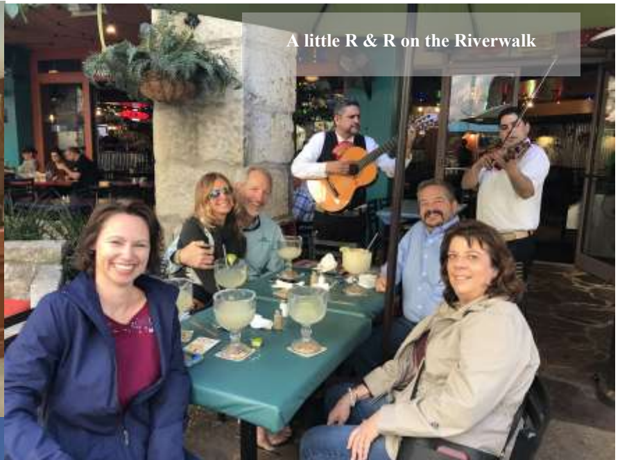
A little R & R on the Riverwalk