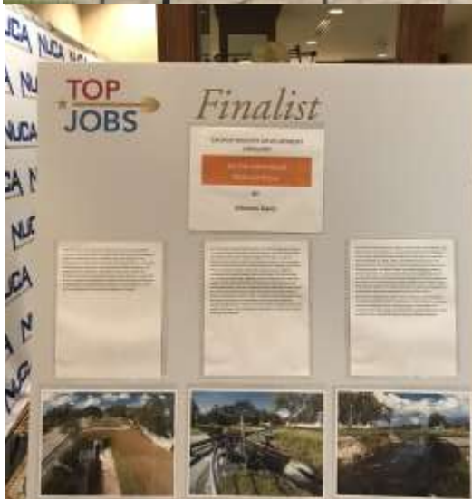
Johnson-Davis Top Jobs finalist