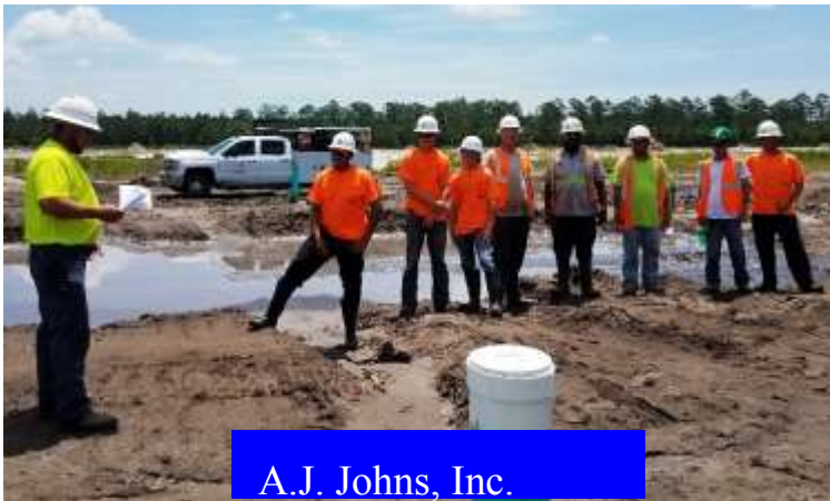
A.J. Johns, Inc.

the overall total number of participants, and publish the names of the companies that held a Trench Safety Stand Down. NUCA national will provide a Certificate of Participation which will be emailed to all participating companies.