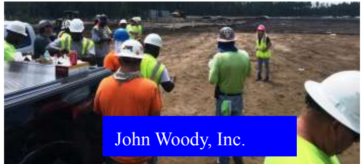
John Woody, Inc.