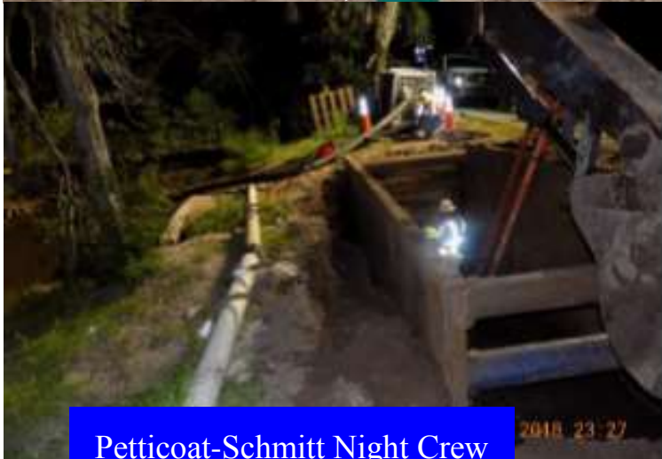
Petticoat-Schmitt Night Crew