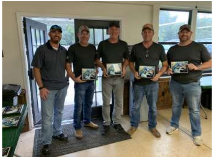
2nd Place Team T.B. Landmark Score: 345