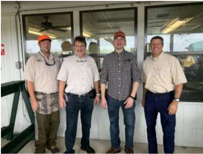
1st Place Team Cecil W. Powell & Co. Score: 362