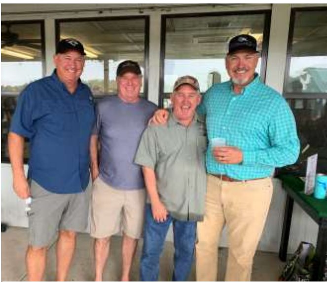
3rd Place Team Pro-Line Survey Supply Score: 344