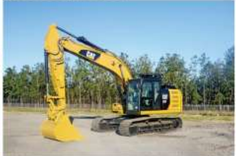
1 of 2 - 2017 Caterpillar 320FL