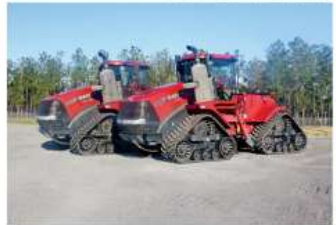
2 - 2017 Case IH Steiger 540