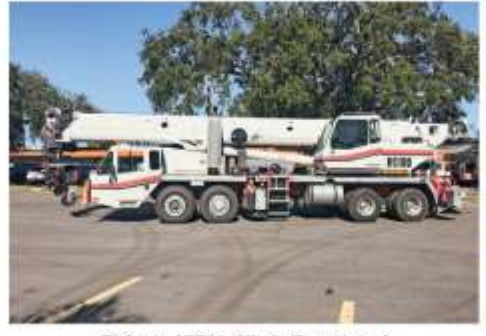
Tadano ATF650XL 65 Ton 8x8x6