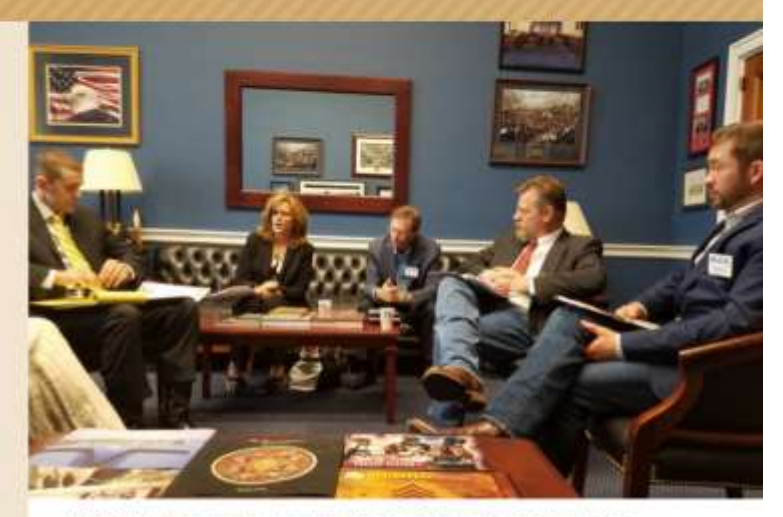
NUCA Members strongly advocated for our industry's priorities to their federal lawmakers during the 2019 Washington Summit.

Safety Directors Forum. The 2019 event in Nashville (Nov. 6-7) was enthusiastically attended by the industry's safety experts, with the event even being sold out. 52 safety directors from across the country heard discussions from five experts about OSHA and industry regulatory enforcement, NUCA's help with member safety programs, gas monitors, distracted driving liabilities, and more safety topics.