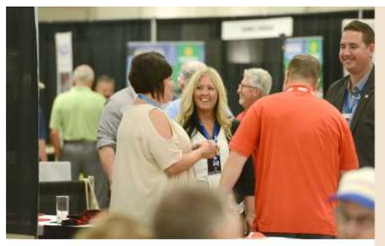
Networking and education with nearby NUCA members easily went together in the Exhibit Hall during NUCA's 2019 Convention and Exhibits.

NUCA Staff. Three new association staff members were hired in 2019, in the areas of chief executive officer, member services, and communications. With the increasing presence of NUCA in the industry and the association's plans for growth in 2020, with these full-time staff additions the association is now in a better position to achieve our goals in key areas of growth.