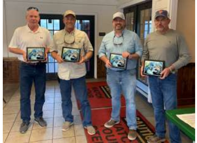
TB Landmark 350