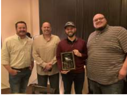
Fortiline Waterworks received a plaque recognizing their 2020 monthly sponsors.