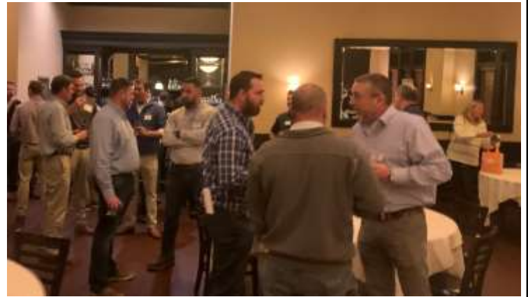
Members getting caught up during the social hour.