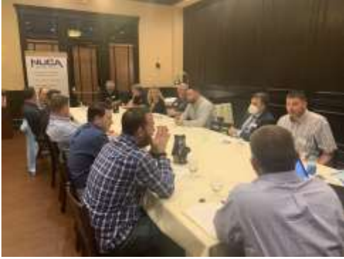
Board of Directors meeting held prior to the Installation