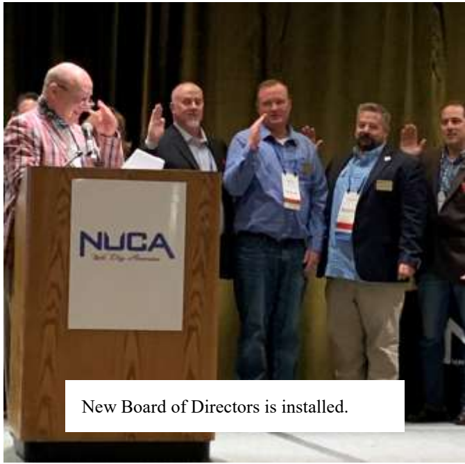
New Board of Directors is installed.