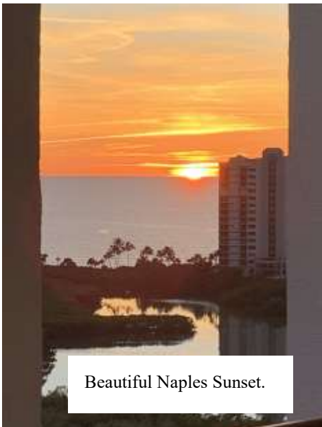
Beautiful Naples Sunset.