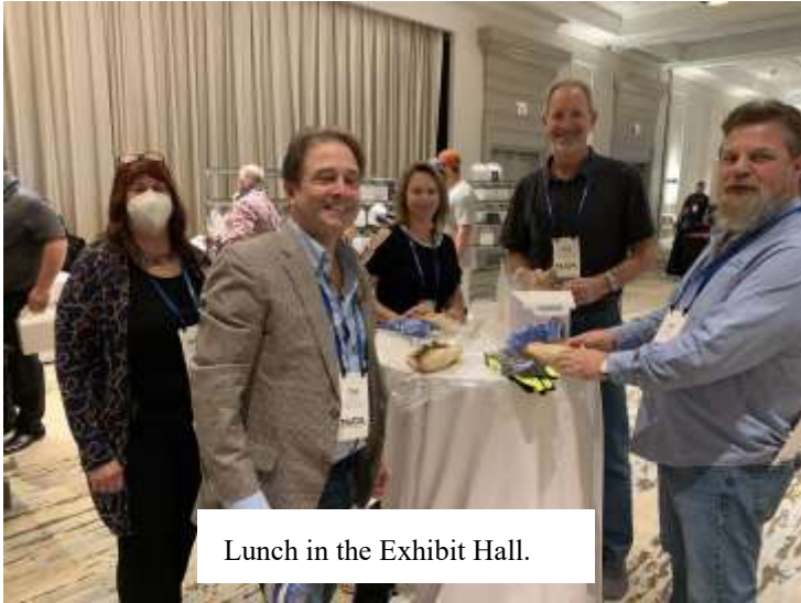
Lunch in the Exhibit Hall.