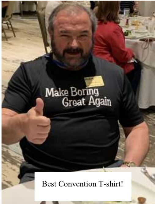
Best Convention T-shirt!