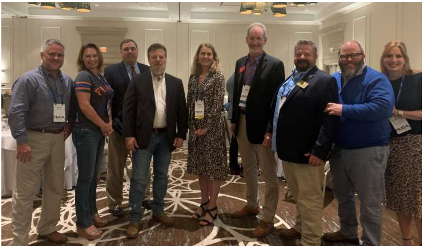
Members of NUCA of North Florida at the Gala Dinner & Award Presentation