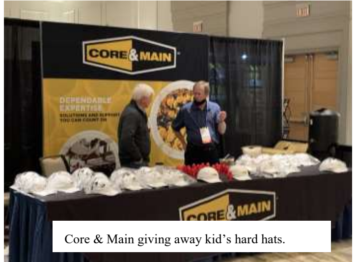
Core & Main giving away kid's hard hats.