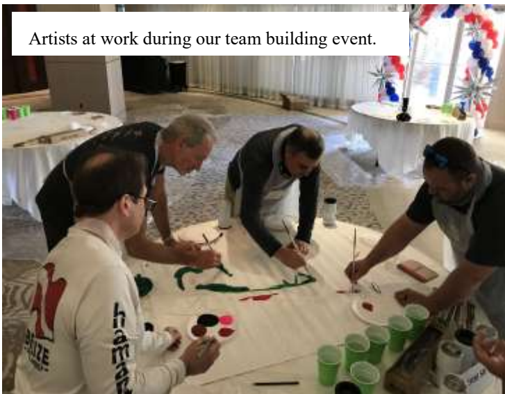
Artists at work during our team building event.