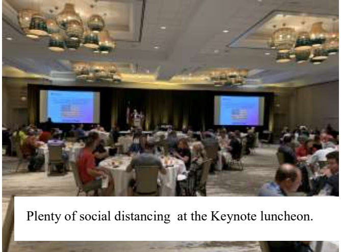
Plenty of social distancing at the Keynote luncheon.