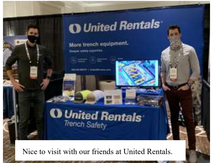
Nice to visit with our friends at United Rentals.