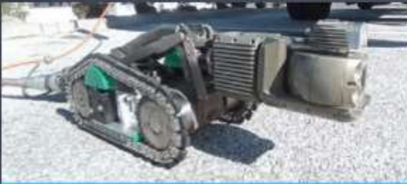
CCTV INSPECTION & LASER PROFILING SERVICES

Offering high quality CCTV and laser profile inspections on storm pipe. Our Rausch and Envirosight equipment is operated by NASSCO, PACP, MACP, and LACP Certified Techs.