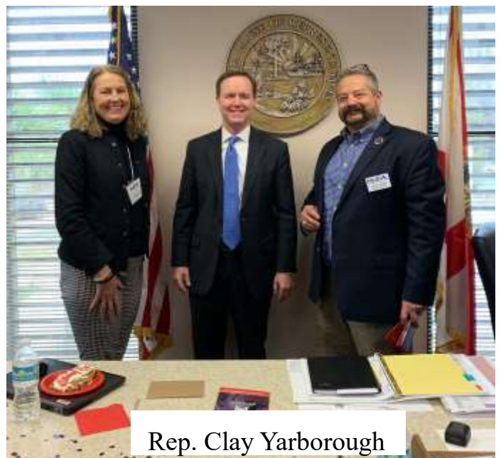
Rep. Clay Yarborough