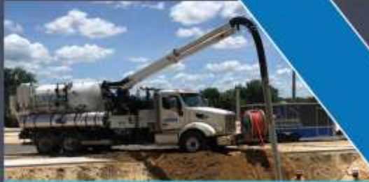
VAC & JETTING SERVICES

Offering high quality CCTV and laser profile inspections on storm pipe. Our Rausch and Envirosight equipment is operated by NASSCO, PACP, MACP, and LACP Certified Techs.