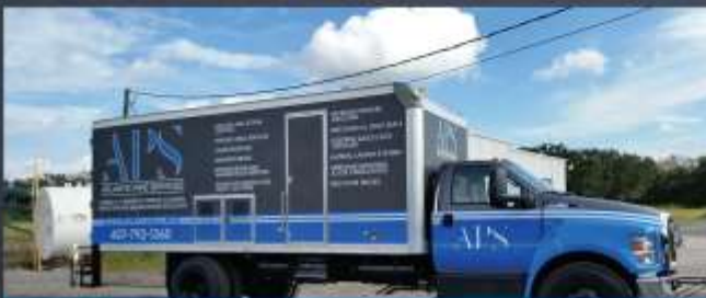
TRENCHLESS PIPE REHABILITATION

APS offers a variety of trenchless pipe repairs on all sizes of pipe: Pressure Grouting, Quicklock installs, CIPP sectional liners, Manhole to Manhole CIPP Liners, Mechanical Joint Seals, Etc.