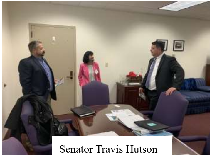
Senator Travis Hutson