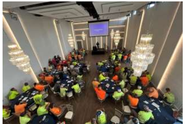
Vallencourt brought their pipe crews inside for some food and education.