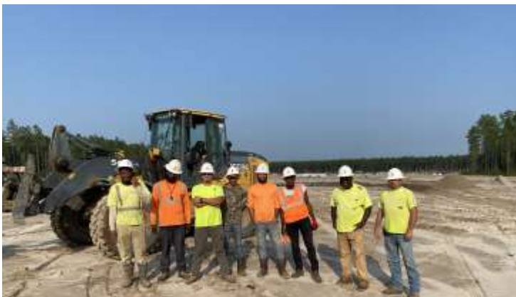
A.J. Johns Inc. conducted tailgate trainings for all their Pipe Crews which included 9 job Sites and 47 employees.

This year was the seventh annual Trench Safety Stand Down (TSSD), generously sponsored this year by NUCA National Partners United Rentals and Sunstate Equipment Co.