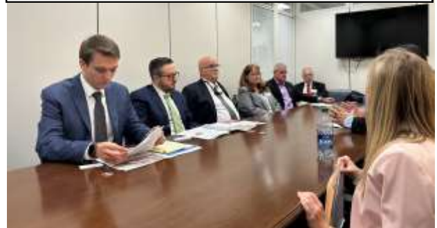
Rep. Kat Cammack came out of a committee meeting for a quick photo.