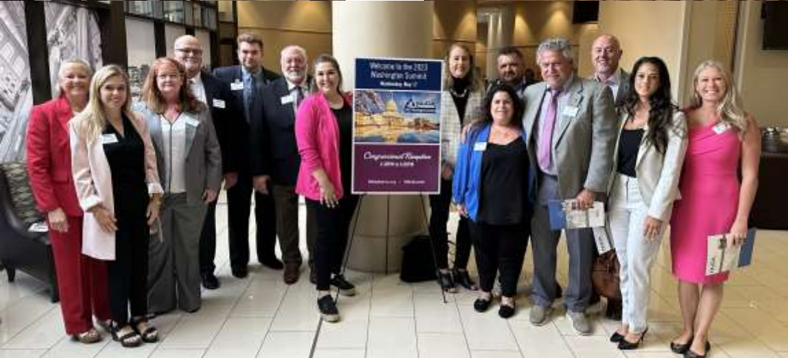
Some of the Florida members in attendance at the Washington Summit.