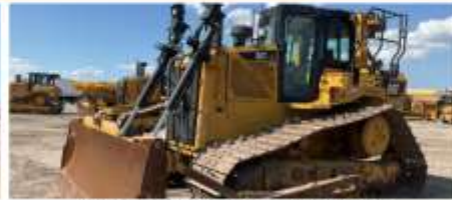
1 of 2 - Late Model Caterpillar D6T