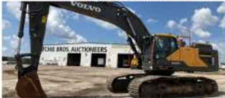
1 of 2 - 2019 Volvo EC480EL VG