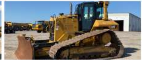
2019 Caterpillar D6N LGP