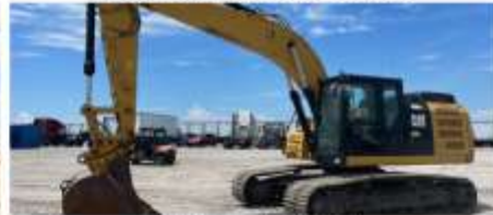
2017 Caterpillar 326F L