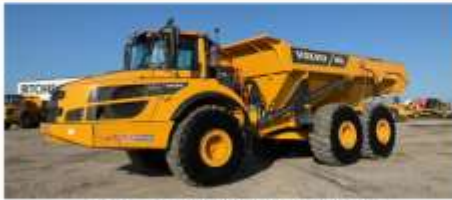
1 of 8 - Late Model Volvo A45GFS