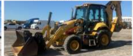
2019 Caterpillar 440 4x4