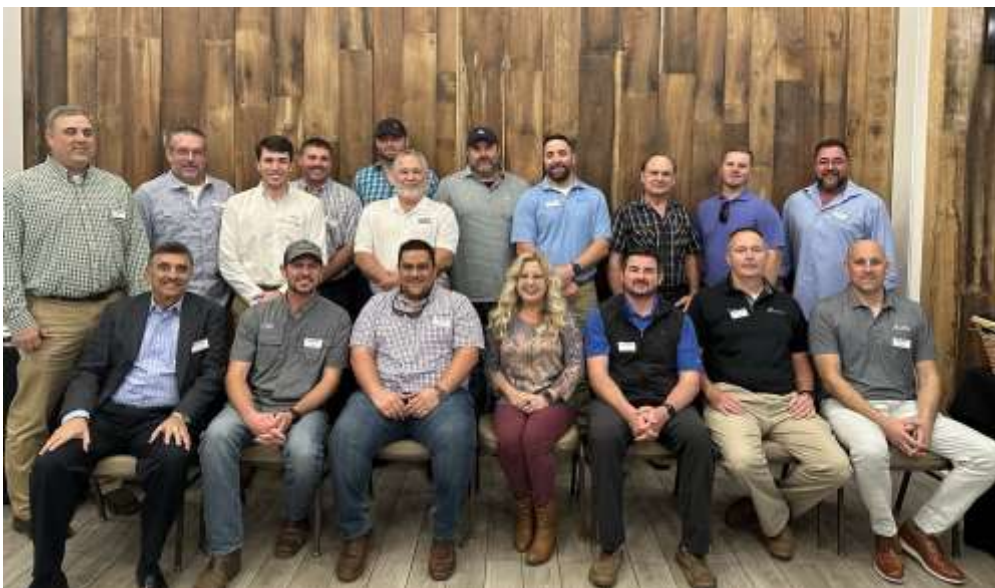
2023 Officers & Board of Directors